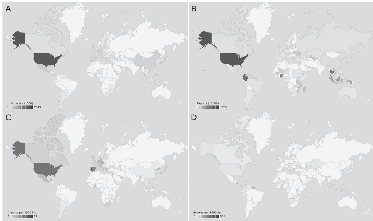
Fig. 3. Maps showing (A) the total number of imported specimens per country under CITES, (B) the total number of exported specimens under CITES, (C) the total number of imported specimens per 1,000 inhabitants, (D) the number of exported specimens per 1,000 inhabitants. Panel C does not show Hong Kong, which has the highest number of imported specimens per 1,000 inhabitants (110). Panels B and D do not show El Salvador, which has the highest number of exported specimens absolutely (5,332,056), and per 1,000 inhabitants (881).

remains relatively constant from 2001 to 2007 (around 1.5 million), there is a steady decline in the number of traded specimens from 2008 onward (from nearly 1,390,319 in 2008 to 1,184,651 in 2010). Again, a few species make up a large part of the total CITES trade with the top ten species making up 73% of the total trade. One species ( I. iguana ) is responsible for 38.8% of the total CITES trade. The top ten species consist of three lizards, two snakes, two crocodylians and two turtles (Table 5). We mapped the total number of imported and exported specimens per country (Fig. 3A, B). In order to ascertain whether these trade volumes are economically relevant to the inhabitants of these countries, we also mapped the numbers of imported and exported specimens per 1000 inhabitants (Fig. 3C, D). This analysis shows that the USA is both the biggest importer and exporter of reptiles and amphibians world-wide. When scaled to the number of inhabitants, North America and western Europe are the biggest importers in addition to Hong Kong. El Salvador has the highest number of exported specimens absolutely (5,332,056), and per 1,000 inhabitants (881).