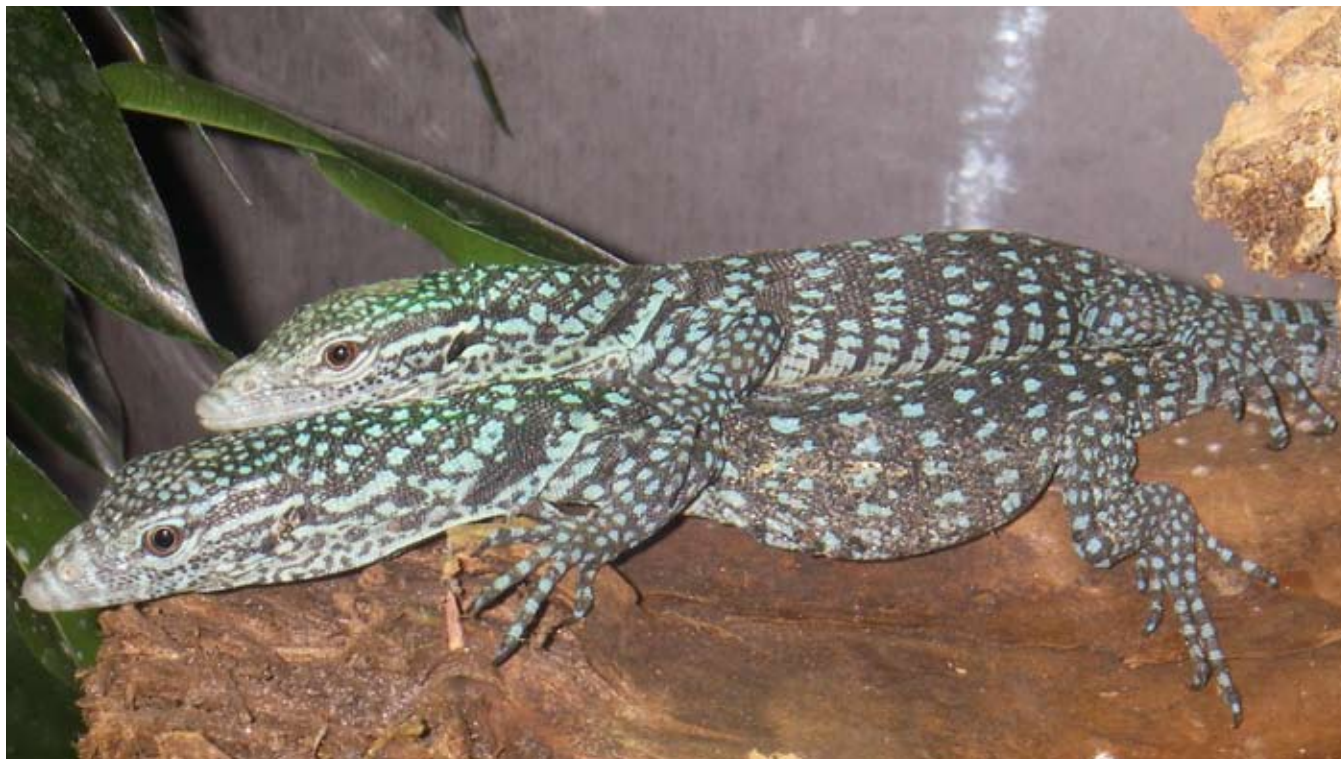
Fig. 5. Two hatchlings from the first V. macraei clutch at Cologne Zoo (20 Nov. 2007).

The four juveniles from the first clutch had SVL of ca. 90 mm, and TL of 130-140 mm. Their weights two days after hatching were 10-11 g. Since the artificially-hatched juvenile was weighed with its remaining egg yolk, its weight was 14 g. Hatchlings from the first clutch were housed together for approximately two months in a glass terrarium measuring 60 x 85 x 60 cm (L x W x H). They were subsequently moved to individual enclosures as a result of increasing differences in size. The juvenile from the second clutch was solely kept in an exhibit measuring 50 x 80 x 60 cm (L x W x H) since hatching. All enclosures provided conditions similar to the enclosure of the breeding pair. Hatchlings began feeding on small migratory locusts within a few days after hatching. Further hatchling husbandry took place without complications. However, it is interesting to note that the juveniles developed different food preferences, e.g., for mice or locusts. Of the four hatchlings from the first clutch of V. macraei , one was unfortunately stolen