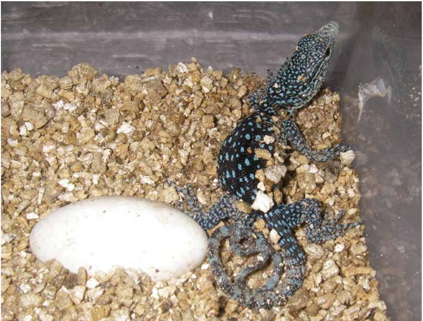
Fig. 4. The juvenile V. macraei depicted in Figs. 2-3 upon hatching (17 Nov. 2007); the prehensile tail of the first hatchling in the Cologne Zoo is already well discernible.