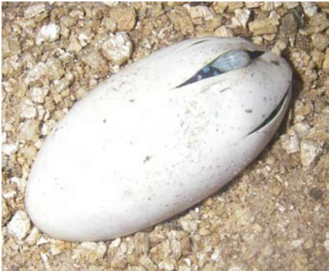
Fig. 2. At early hatching stage, only the snout of the juvenile V. macraei is protruding (16 Nov. 2007).