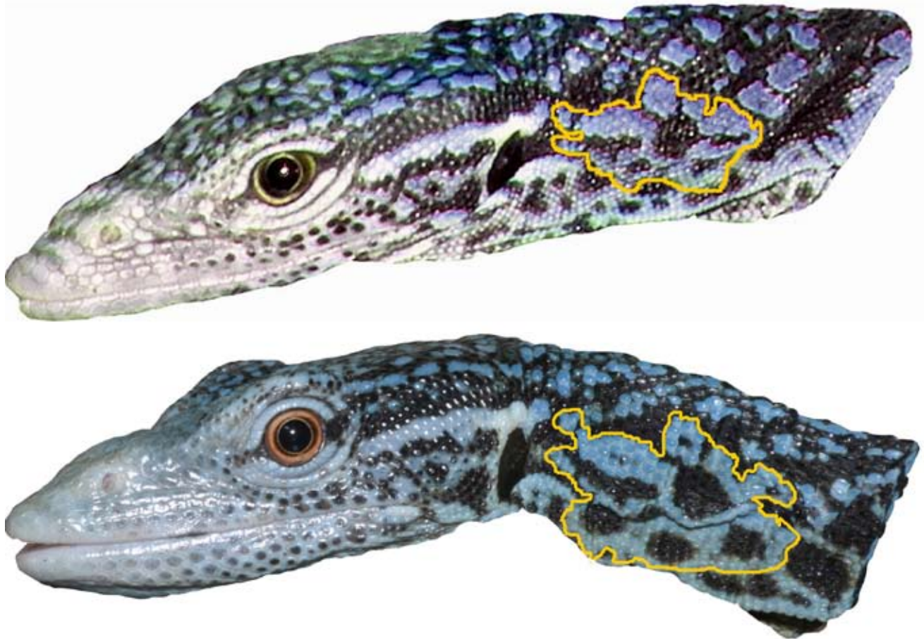
Fig. 8. The neck pattern of V. macraei may serve for the recognition of individuals as is shown here for the specimen depicted on the top of Fig. 5; above: immediately after hatching (20 Nov. 2007, photograph by Norbert Rütz ), and below: 16 months later (27 March 2009, photograph by Thomas Ziegler ).

pattern (left side) of the stolen specimen, consisting of three dark ball-like structures at the lower neck, is well discernible from a figure published in Ziegler (2008: 10) and in the November issue (Vol. 2, No. 4:148) of this journal (available at http://varanidae.org/Vol2_No4.pdf ).