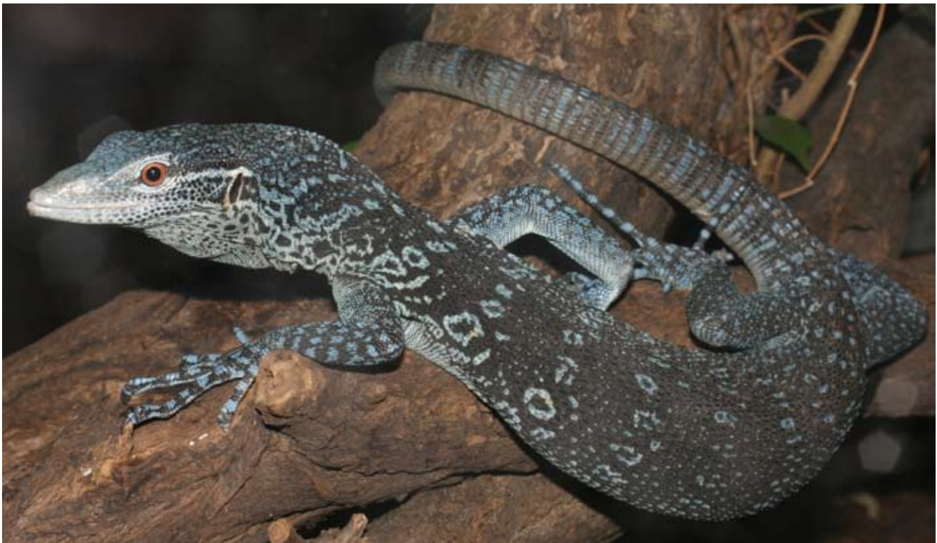
Fig. 1. The confiscated wild-caught female Varanus macraei after one year at Cologne Zoo (12 Jan. 2008).

The confiscated pair of V. macraei was placed together in a glass terrarium measuring 200 x 100 x 70 cm (L x W x H). The breeding pair was kept behind the scenes, inaccessible to the public. The enclosure was equipped with massive branches, cork tubes, and live plants (e.g., Ficus sp.) for climbing and hiding. The substrate consisted of pine bark. Light was provided by two fluorescent tubes (54 W) and two basking lamps (100 W) which also supplied ultraviolet light. Photoperiod was approximately 13:11 h (light:dark), however some lights were regularly turned off to simulate natural cloud cover, controlled by timers. Ambient temperatures of 29–32 °C were provided by light sources with a maximum temperature up to 40 °C directly beneath the basking