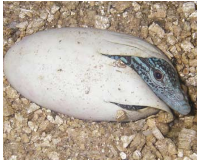
Fig. 3. Hatching V. macraei (16 Nov. 2007).