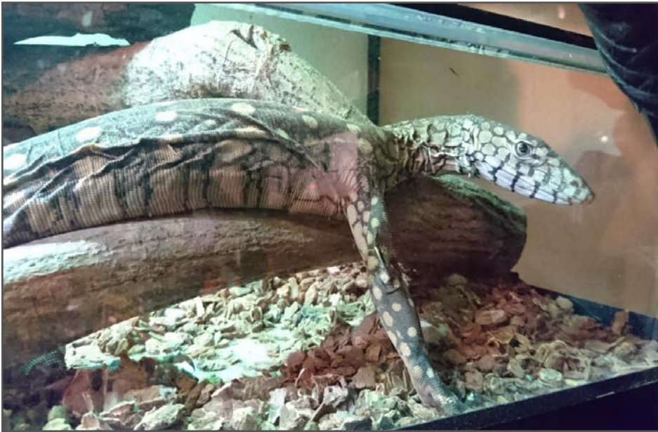
Fig. 3 Perentie ( Varanus giganteus ) for sale in a Japanese reptile shop for $53,100 USD.

given the limited number of individuals encountered with advertised prices (Table 1).